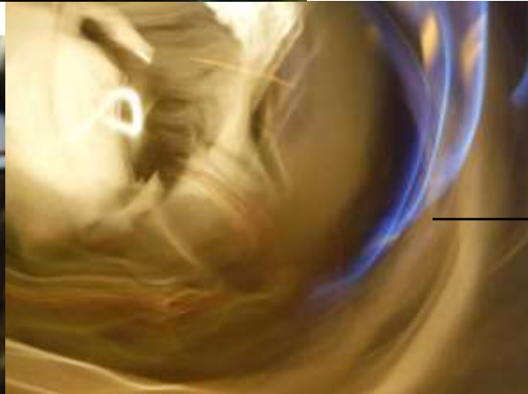
Figure 14 Example of flickering yellow flame and flame rollout when blower kicked on; have an HAVC contractor evaluate furnace for replacement (safety concerns).