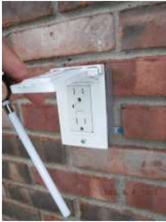
Figure 6 The GFCI in front was found tripped and would not reset; further evaluate and retest when repaired or resolved.