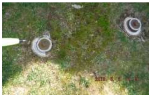
Figure 1 There were two raised cleanouts; further evaluate to see what these are for ( ex- gutters or house plumbing); unknown. These pose a trip hazard.