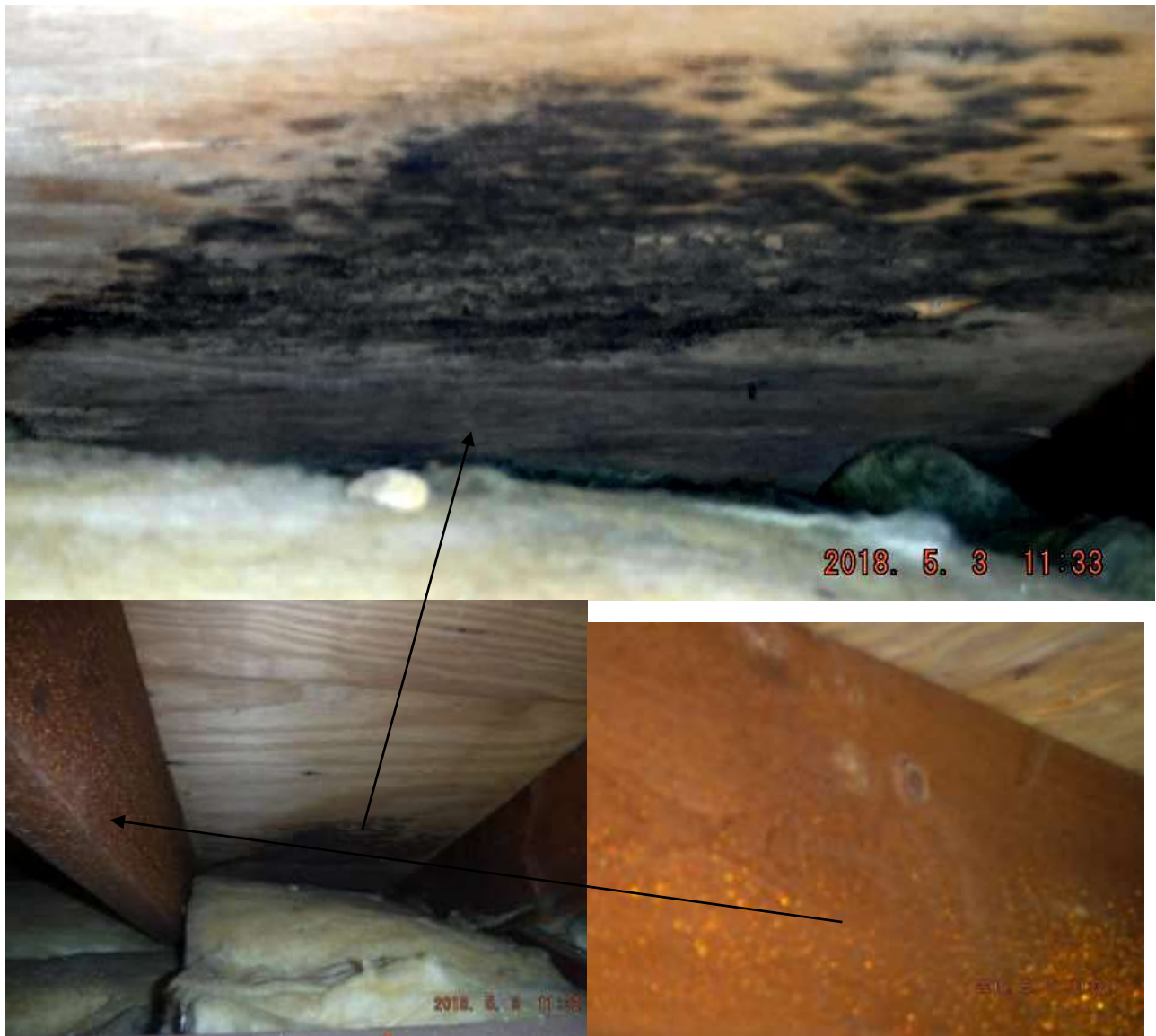
Figure 3 Example of dark mold like staining and pine sap beads; poor ventilation, hot & humid conditions.