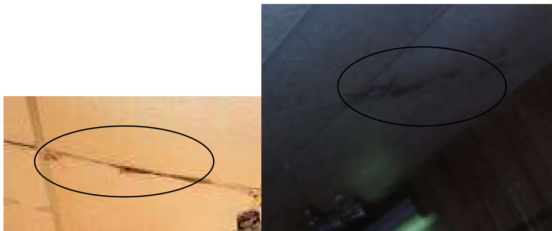
Figure 12 Water stains on ceiling tiles; further evaluate by a licensed plumber.