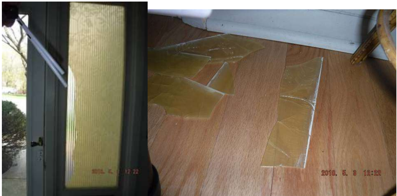
Figure 9 Yellowed plastic panel over glass on front door.

NFPA211) chimney inspection when changing ownerships and when fuels have been changed from oil to gas in older homes to avoid costly repairs and ensure life safety. See heating section comments.