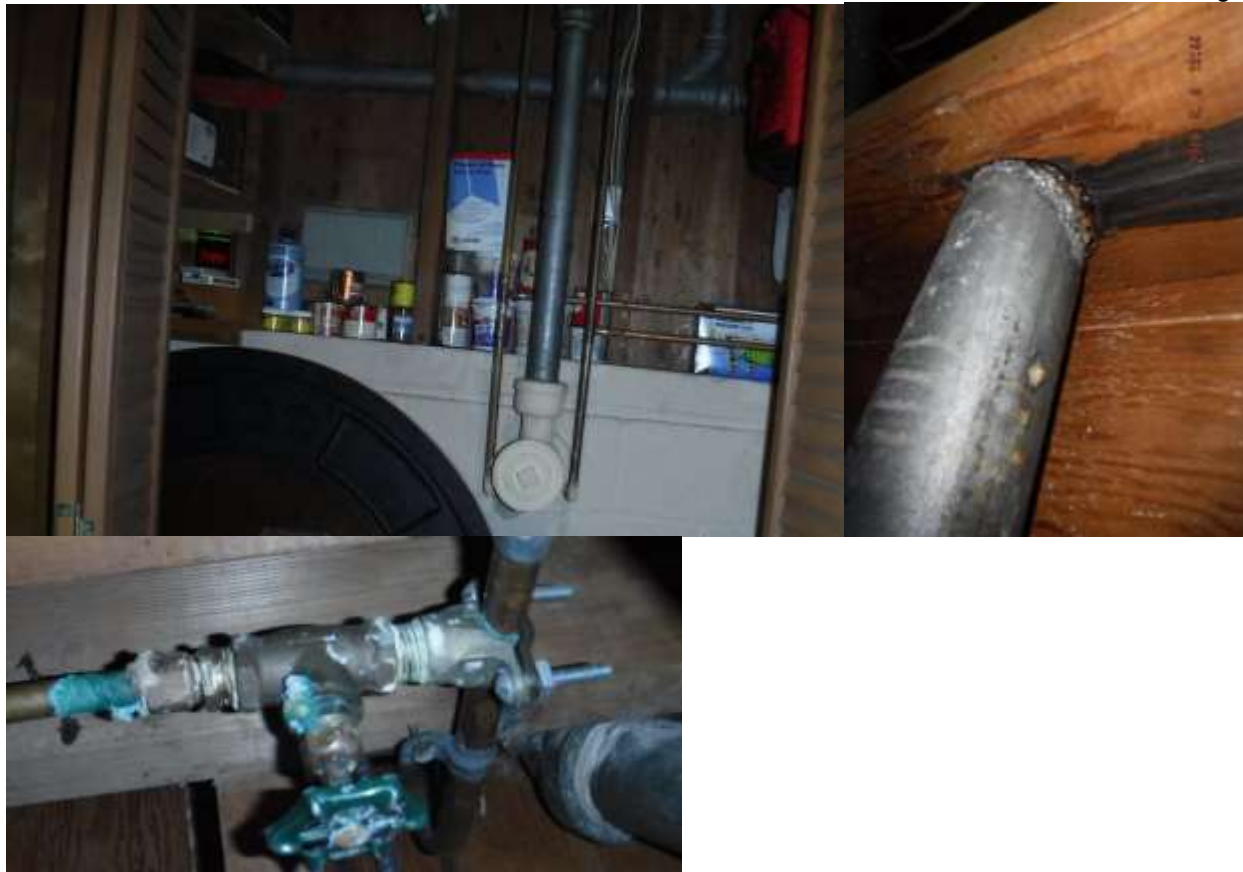
Figure 13 Examples of older plumbing, corrosion, water stains/leaks, etc.