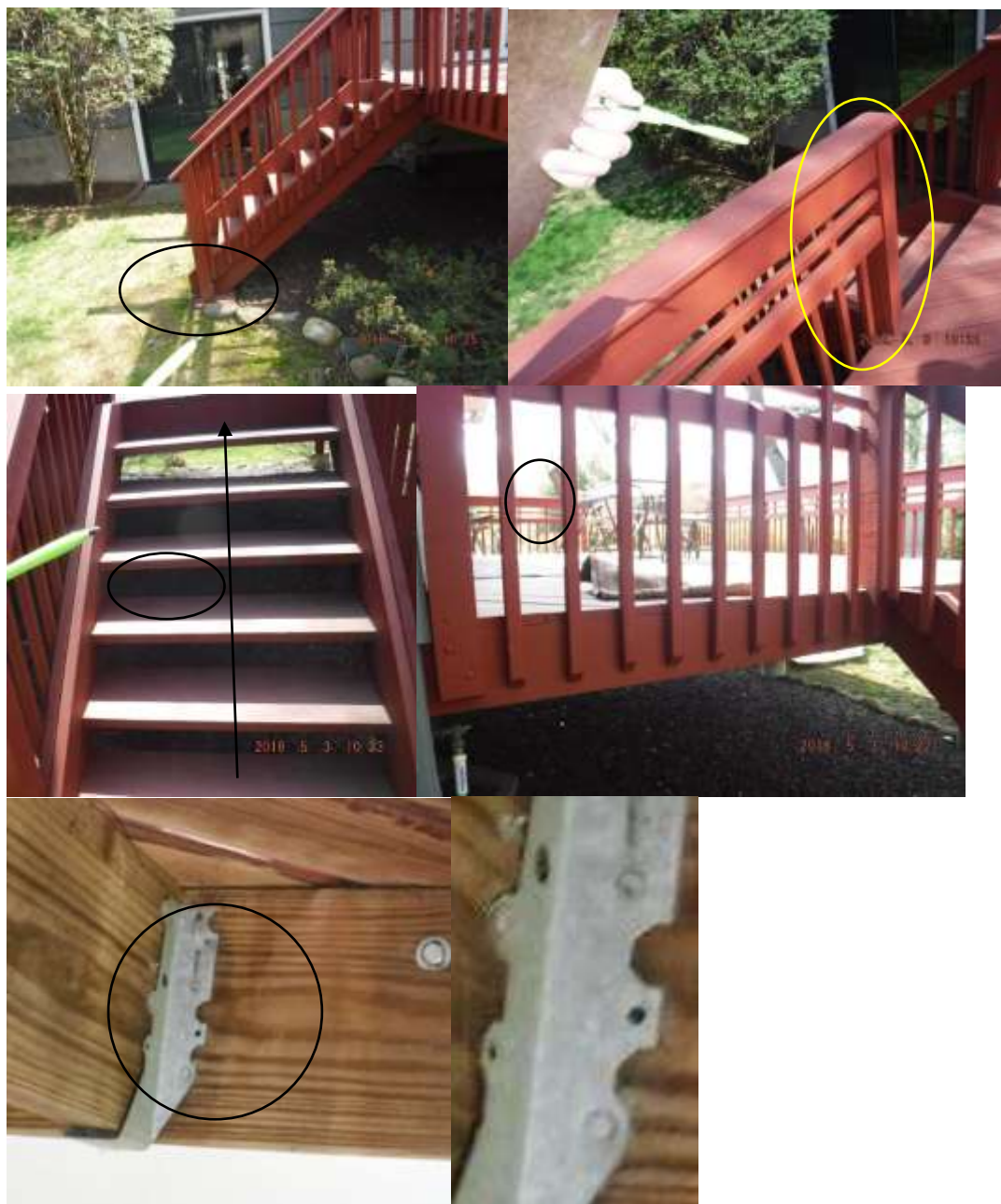
Figure 2 Example of older deck construction and unconventional by today's building practices. The deck was older and past expected life. The balusters were wide (small child safety concern), missing middle stringer & steps not boxed in (trip hazard), railings on low side (potential safety concern), steps in contact with soil (no visible footer), heavily painted, drying cracks, missing nails in floor joist hangers (need to be filled for proper supports), house/deck flashings not visible or present, etc. Recommend a carpenter or building contractor evaluate deck and advise on repairs/upgrades/replacement due to age.