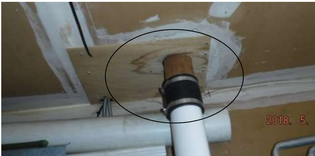
Figure 5 Water or moisture stains around a PVC plumbing vent in garage and foundation walls. Recommend a licensed plumber further evaluate and advise on any active leaking or rule out. See grading & drainage comments.