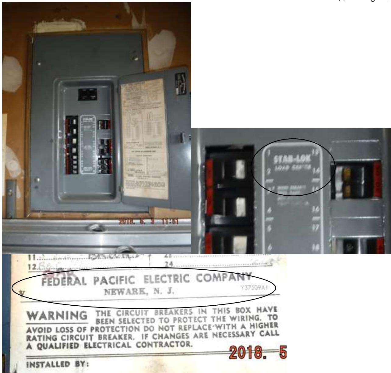
Figure 16 Recommend a licensed electrician evaluate panel for replacement. Federal Pacific Electric Stab-Lok panels are known latent fire hazards.