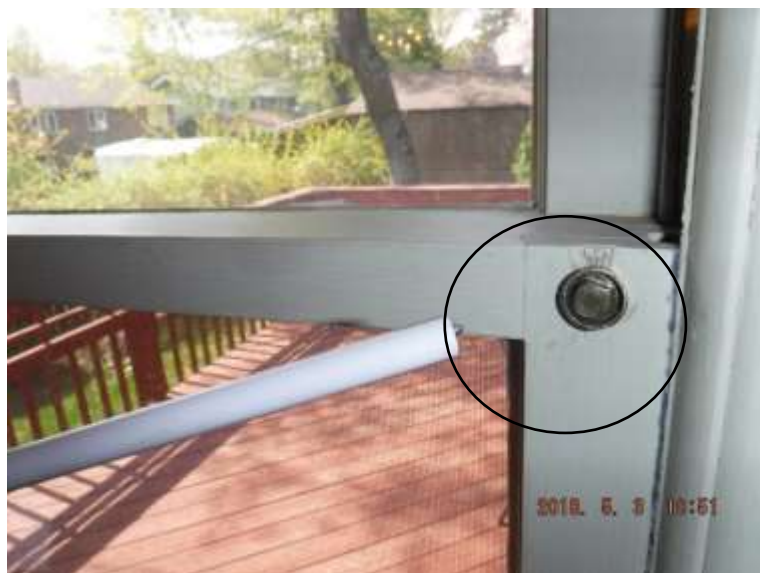
Figure 7 Example of window locks in the home; inaccessible. Recommend having locks opened up and check windows.

DINING ROOM : The windows were locked with a corner nail or hardware. Follow up with sellers for the key or device to open the windows. Recommend checking windows before closing.