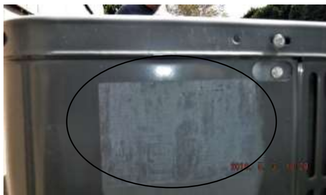
Figure 15 Data tag on condensing unit was worn off; indication of possible older unit. Have evaluated along with the furnace by an HVAC contractor.