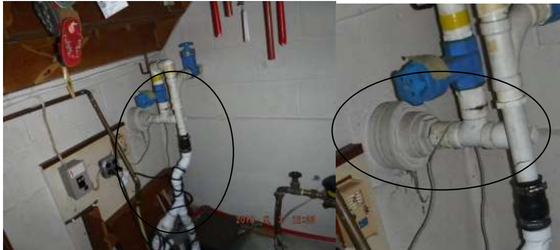
Figure 10 A1 sump pump/Liberty water powered pump was piped to the municipality drain; improper installation and not allowed in NJ.