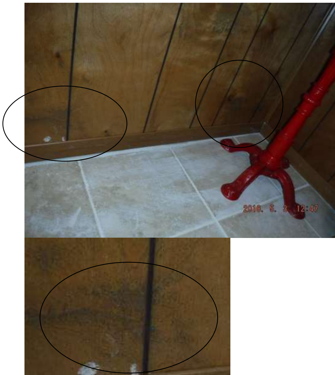
Figure 11 Example of water & dark stains on painted foundation walls or paneling in basement; limited view due to storage, wall hangings, finished basement. There were dark stains, spotting or moisture stains on paneling. Mold and environmental testing & inspection are beyond the scope of a home inspection. Follow up with a mold or environmental company for that service.