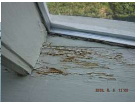
Figure 8 Active leaking/moisture, water stains, flaking paint, vapor seal breaks, etc. Recommend a window installer evaluate window for replacement/repairs and rule out any concealed damage.