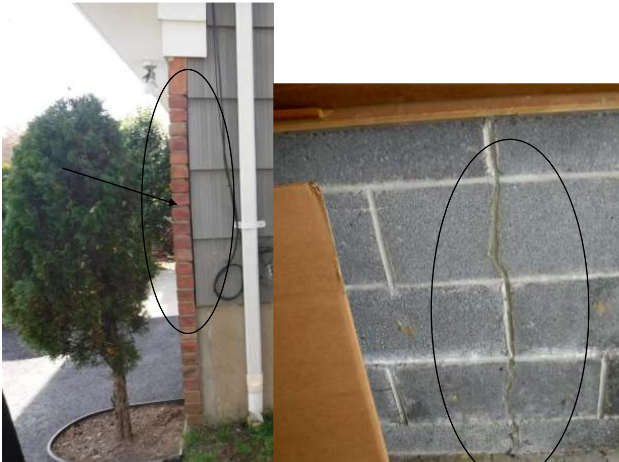
Figure 4 Examples of foundation cracks; exterior, garage, etc. The brick veneer had gap and slight bow; have evaluated by siding contractor before closing & contractual limitations.